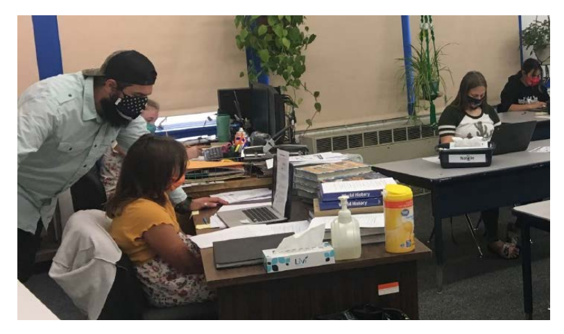
PLAINTIFF'S FIRST AMENDED VERIFIED COMPLAINT | 15